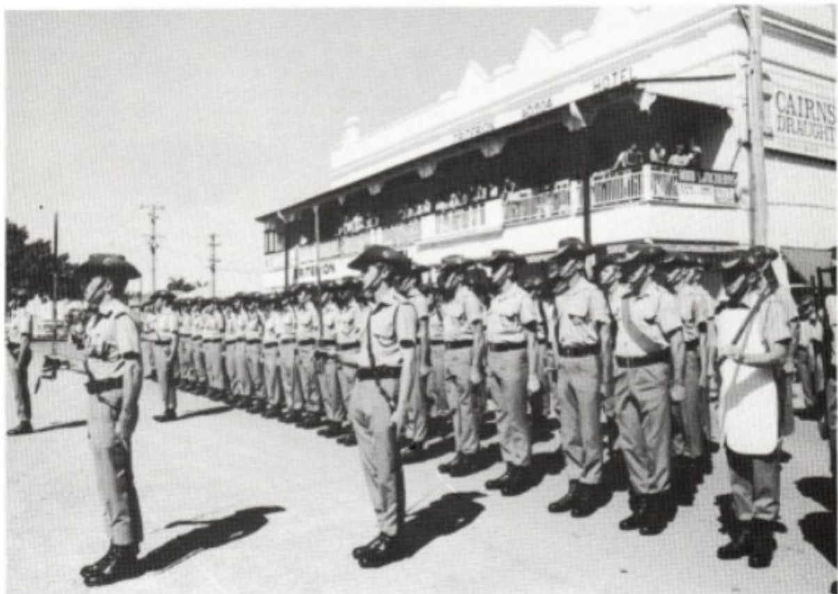
The Battalion forms up in front of the Criterion Hotel in preparation for the march through the city.

The 2nd/4th Battalion, having been granted Freedom of the City of Townsville, had the honour of leading the parade.