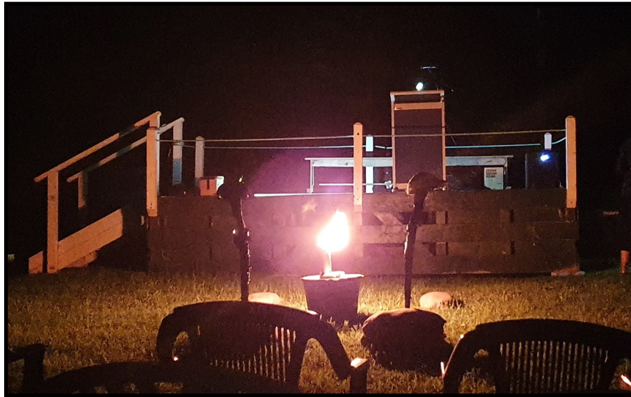
Preparations for the Dawn Service.